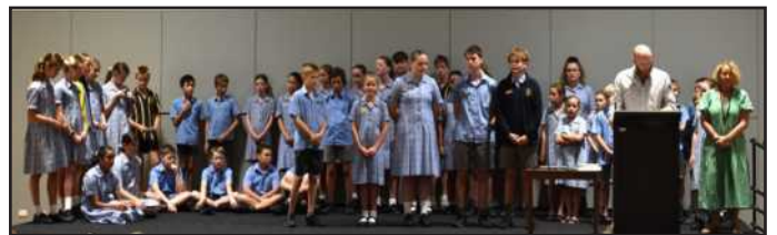
Leaders on the stage