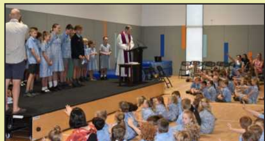
Blessing all new leaders