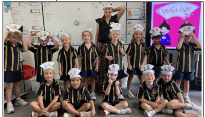
Reception MP with the hats they made in Japanese