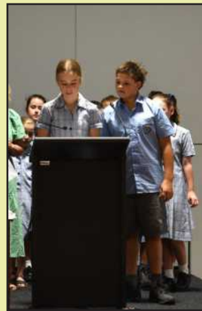
Acknowledgement of country