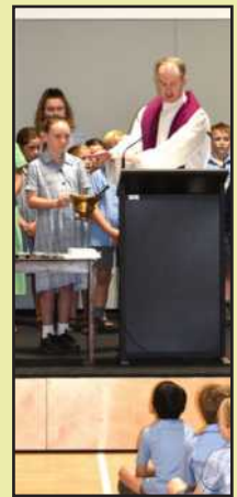
Blessing the badges