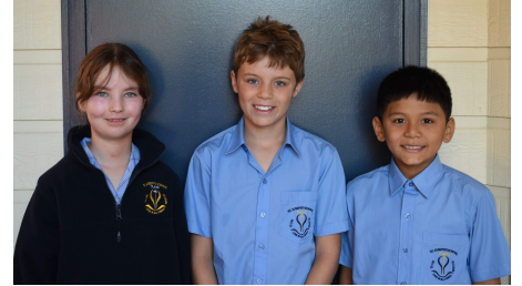
Year 6 Ward